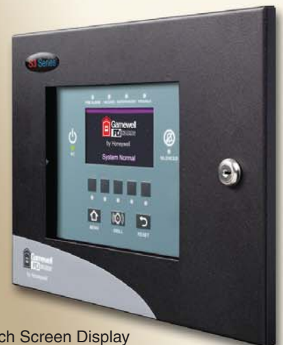
Touch Screen Display for Optimal Annunciation